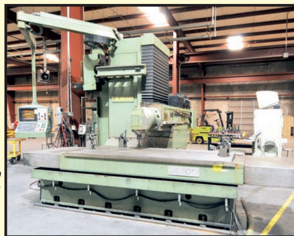
PARPAS SL100/1300 CNC BED TYPE MILL

REACT TOOL & MOLD 150 T. CAP. , 48" x 48" sliding bolster, 48" x 48" drilled and tapped ram, 27-1/2" stroke, 19" min. shut ht., 46.5" max. shut ht., 48" x 36" dist. btwn. 4" dia. posts, top mtd. unitized hydraulics, hyd. safety catch mechanism.