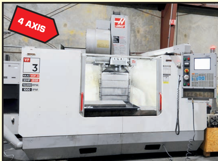
HAAS VF3D VERT. MACHINING CENTER