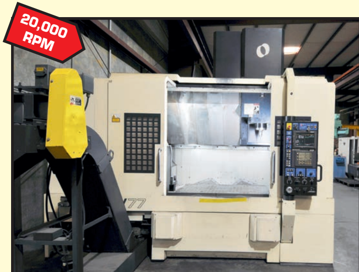
MAKINO V77 HIGH SPEED VERT. MACHINING CENTER