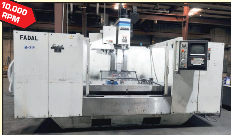
FADAL 6030HT VERT. MACHINING CENTER