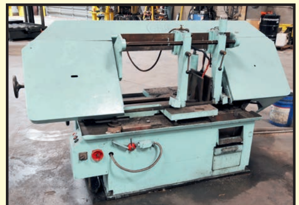
FORTE 16" X 20" CAP. HORIZONTAL BANDSAW