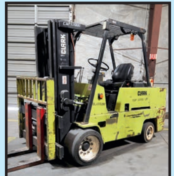
CLARK 12,000-LB. DIESEL FORKLIFT