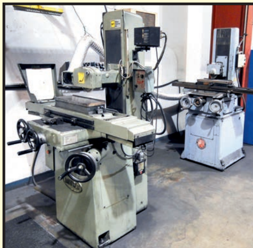
HAND FEED SURFACE GRINDERS