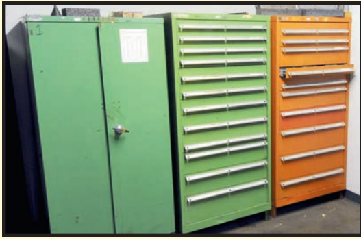
ROLLER DRAWER TOOL CABINETS