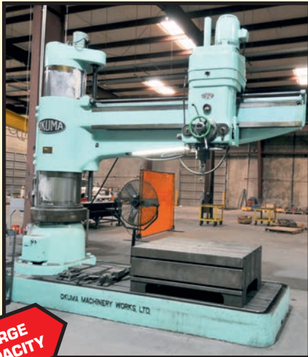
OKUMA 8' X 20" RADIAL ARM DRILL