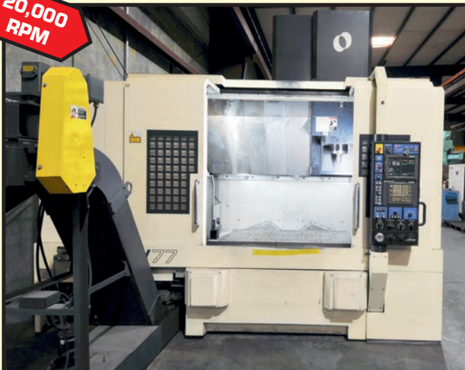
MAKINO V77 HIGH SPEED VERT. MACHINING CENTER