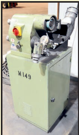
PARPAS TYPE AU3 SINGLE LIP CUTTER GRINDER