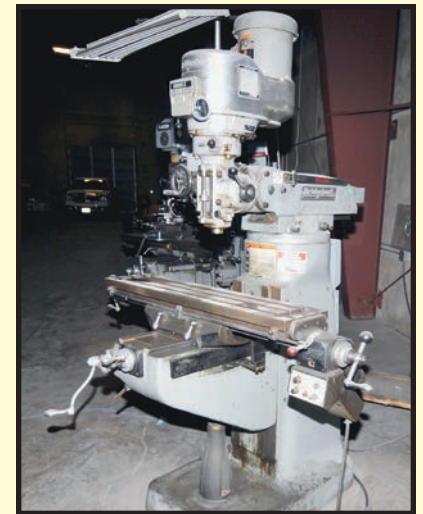
BRIDGEPORT SERIES I VERT. TURRET MILL