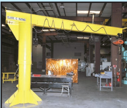
WOLVERINE 2 T. FREE STANDING JIB CRANE