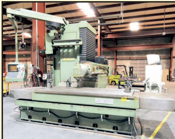
PARPAS SL100/3000 CNC BED TYPE MILL

TUESDAY, MAY 11 • 10:00 A.M. LIVE ONLINE WEBCAST (NO ONSITE BIDDING)