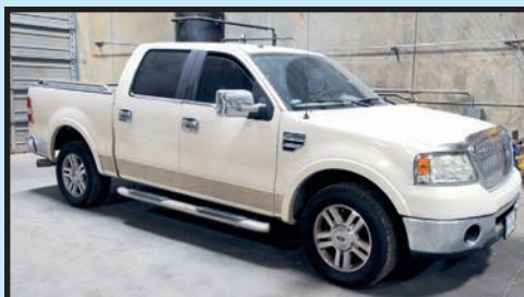
FORD LARIAT PICKUP TRUCK

If you need assistance, don't hesitate to call (713) 691-4401. ALL BIDS ARE SUBJECT TO AN 18% BUYER'S PREMIUM.