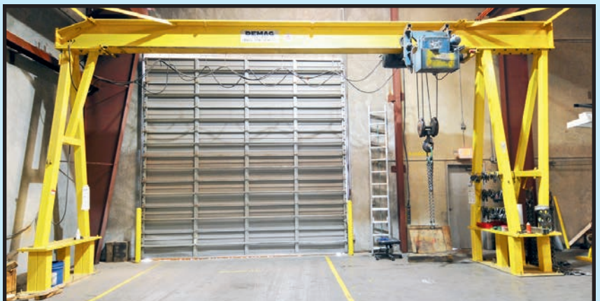
DEMAG 10 T. GANTRY CRANE