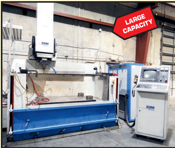
EDM SOLUTIONS "TITAN" CNC RAM TYPE EDM