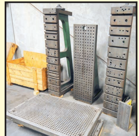
ASSORTED MACHINE ACCESSORIES