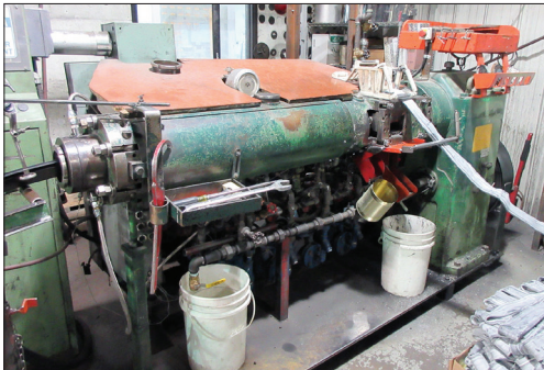
Extruder Department w/Royle 6" & Troester 3" Extruders