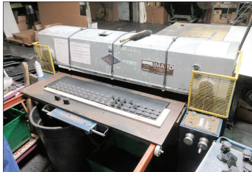
Clicker Press Department, Up to 5' x 4' Platen