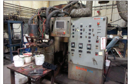
Complete State Mix Urethane Department