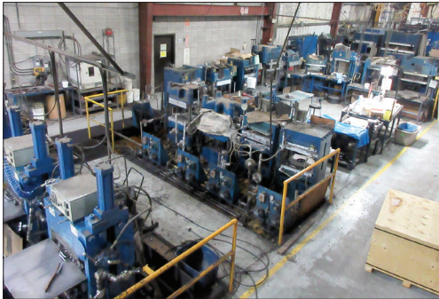
(31) Rubber Presses, Up to 54" x 96" Platen, Up to 34" Daylight

INSPECTION: Tuesday, April 12, 9am to 4pm MT • ADDRESS: 511 12th Avenue, Nisku, AB T9E 7N8