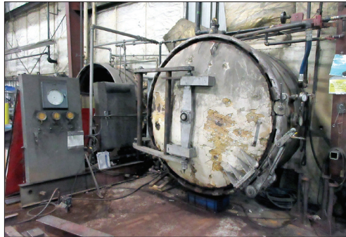
(2) Autoclaves, Up to 70' x 7' Diameter, Plus 3 Spares Available