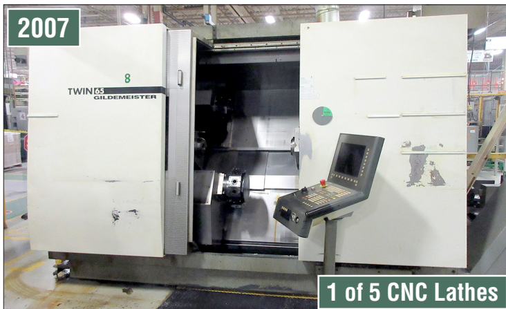
DMG CNC Lathe, Model Twin 65