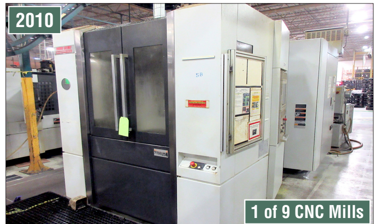
MORI SEIKI CNC HMC, Model NH 5000