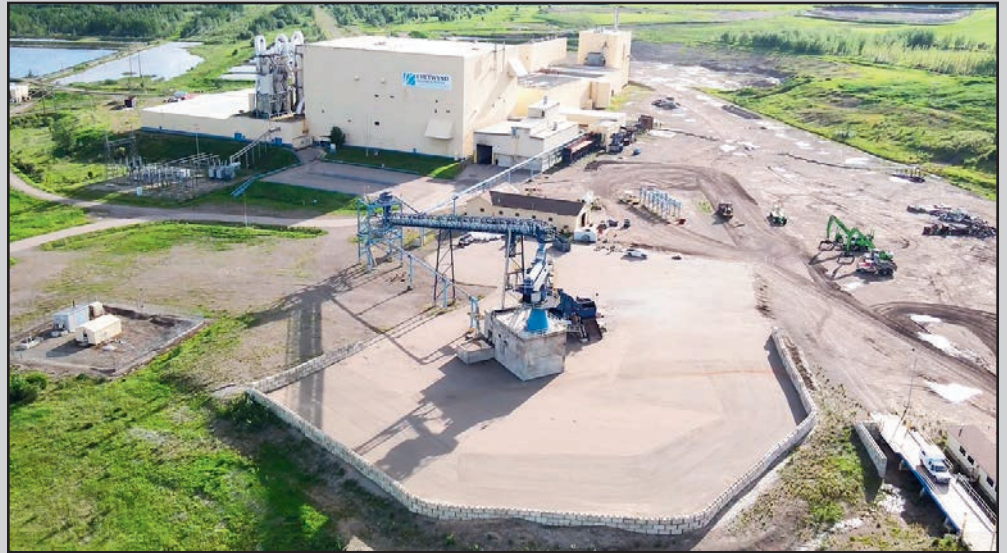
MILL SITE AERIAL VIEW