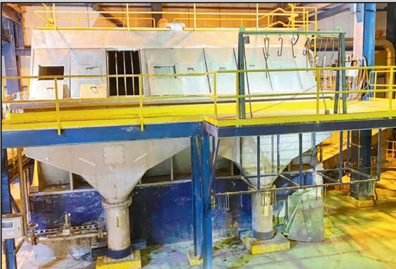
CELLECO 316 STAINLESS STEEL DISC FILTER