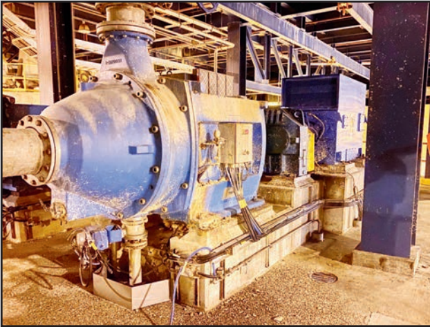
METSO 42" REFINER WITH 2,000 HP DRIVE