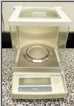
METTLER TOLEDO ANALYTIC BALANCE