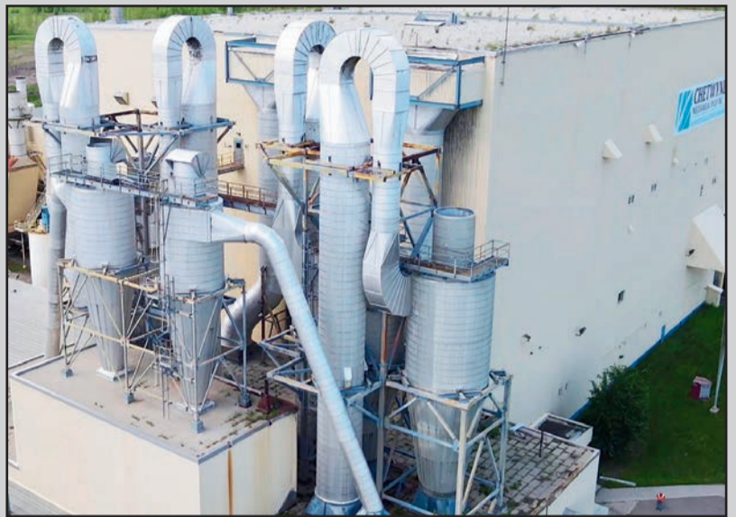
FLAKT DRYER DRYING CYCLONES