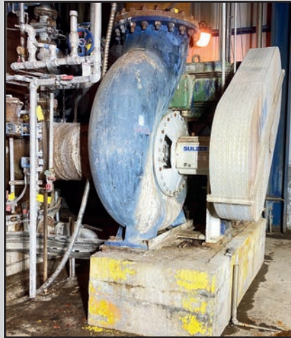
(1 OF 10) SULZER 24" X 24" CENTRIFUGAL PUMPS