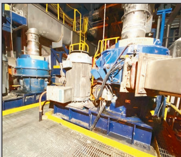
(2) AB NILSEN FLUFFER-MIXERS WITH 350 HP DRIVES