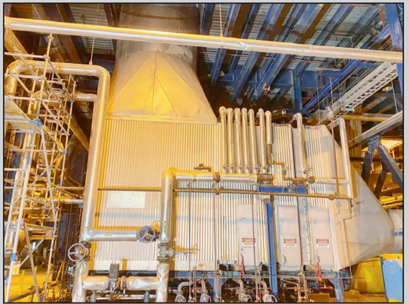
(1 OF 2) FLAKT STAINLESS STEEL STEAM COIL FLASH DRYERS