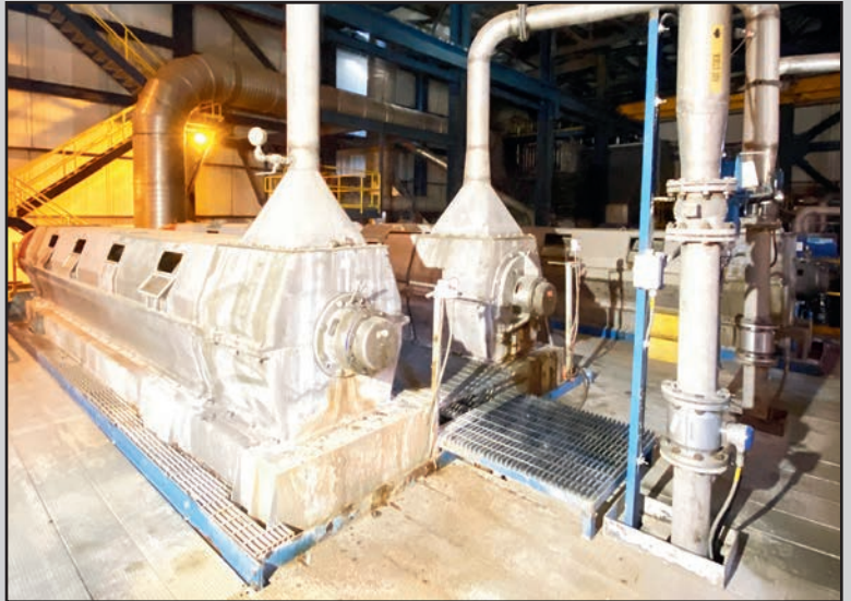
(2 OF 8) THUNE SP70 SL STAINLESS STEEL HYDRAULIC SCREW PRESSES