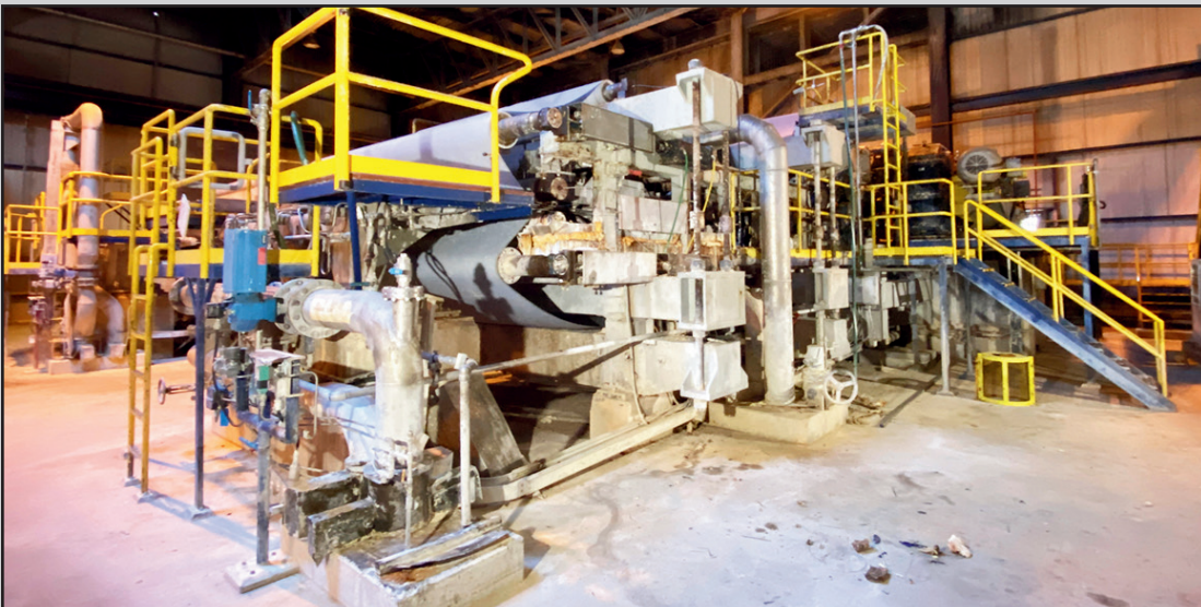
(1 OF 2) HYMAC 19' TWIN WIRE DE-WATERING PRESSES