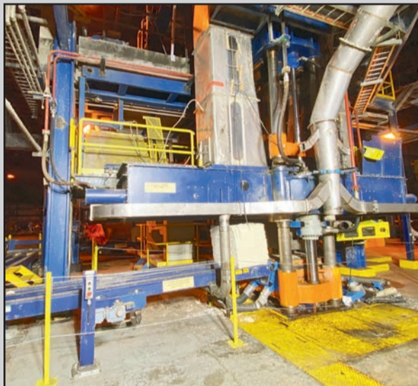
(1 OF 2) NILSEN CNC HYDRAULIC PLC SLAB PRESSES