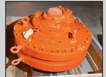
(NEW) HYDRAULIC DRIVE HEAD