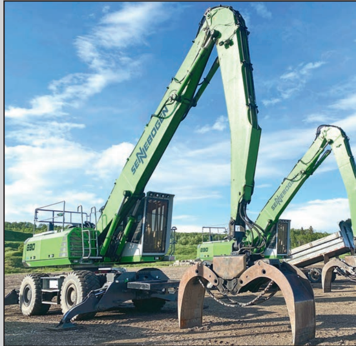
SENNABOGEN MATERIAL HANDLER