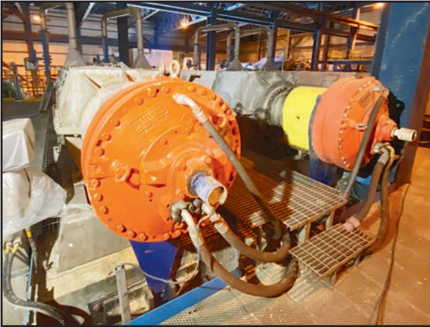
(2 OF 8) THUNE SP70 SL STAINLESS STEEL HYDRAULIC SCREW PRESSES DRIVE END