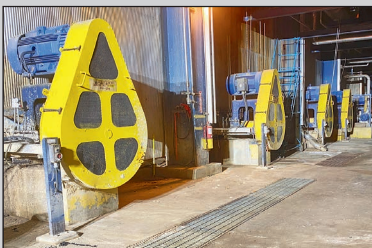
STAINLESS STEEL STOCK CHEST WITH 150 HP AGITATORS

(4) BIRD Mdl. 400, s/n ST13090, stainless steel pressure screens with 125 HP drive.