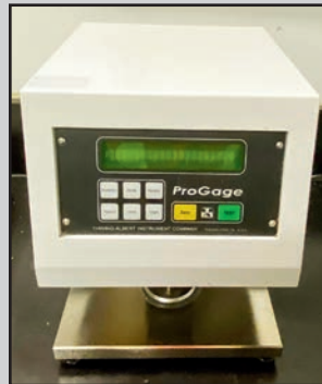
THWING ALBERT PROGAGE THICKNESS TESTER