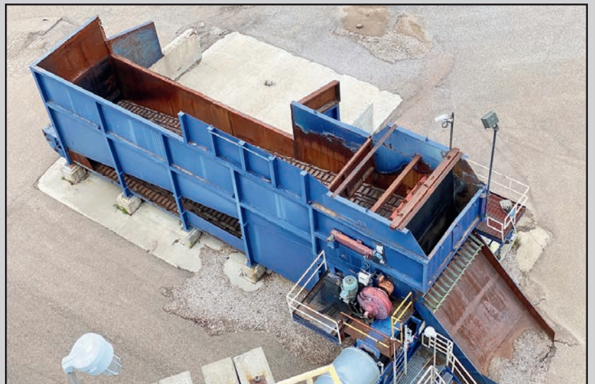
LIVE BOTTOM CHIP BIN-FEEDER