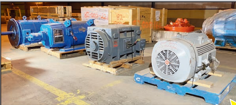
(SAMPLE) LARGE MOTOR INVENTORY

ALSO FEATURING: Lab Equipment, Stainless Steel Tanks, Fiberglass Tanks, Surge Bins, (2) Forklifts, (3) Pickup Trucks, Scissor Lifts, Reach Trucks, Process Piping of Carbon Steel, Stainless Steel, Copper and Plastic, Fittings and Valves, Shop Support Equipment, Lista Cabinets, Contents, and Too Much More, Don't Miss This Auction!