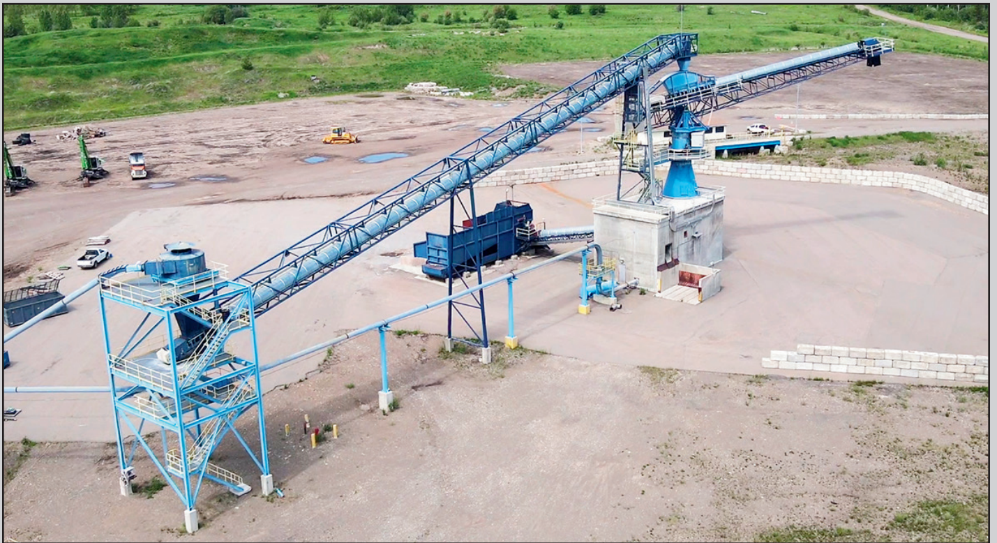
RADER RADIAL CHIP STACKING SYSTEM