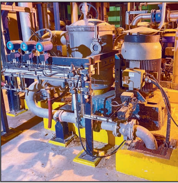
(1 OF 4) BIRD PRESSURE SCREENS