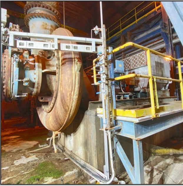
(1 OF 4) ALLIS CHALMERS MVR COMPRESSOR

(150+) Sulzer Pumps with Drives up to 900 HP.