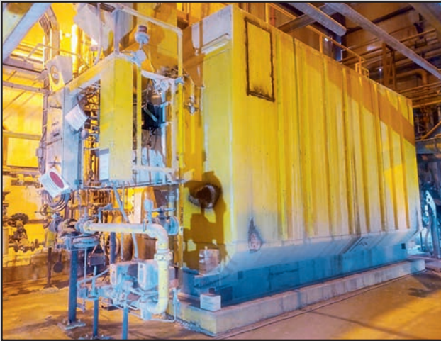
NEBRASKA PACKAGE STEAM BOILER