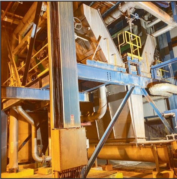
STAINLESS STEEL SIDE HILL SCREENS