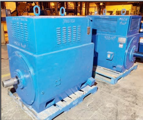
(SAMPLE) NEW 400-700 HP MOTORS