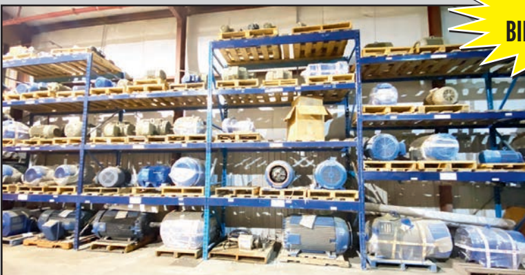
(SAMPLE) SPARE MOTOR INVENTORY

ALSO FEATURING: Lab Equipment, Stainless Steel Tanks, Fiberglass Tanks, Surge Bins, (2) Forklifts, (3) Pickup Trucks, Scissor Lifts, Reach Trucks, Process Piping of Carbon Steel, Stainless Steel, Copper and Plastic, Fittings and Valves, Shop Support Equipment, Lista Cabinets, Contents, and Too Much More, Don't Miss This Auction!