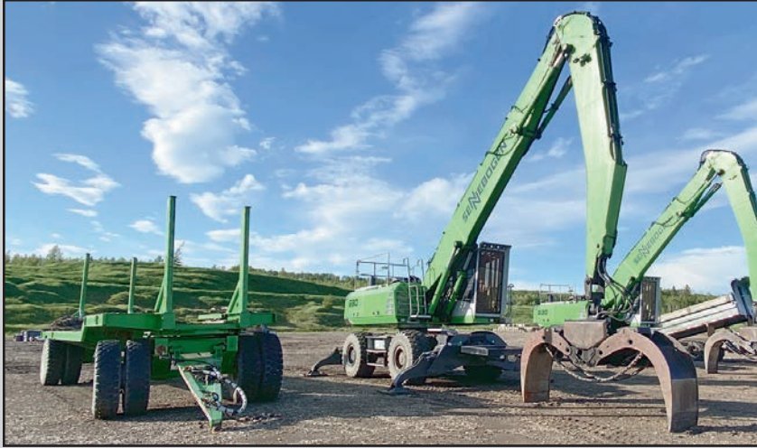
SENNABOGEN MATERIAL HANDLER WITH LOG TRAILER

ASPEN 30' x 108" Off-Road Log Trailer, with pintel hook.