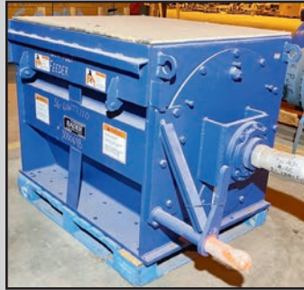
(NEW) RADER REPLACEMENT CHIP FEEDER