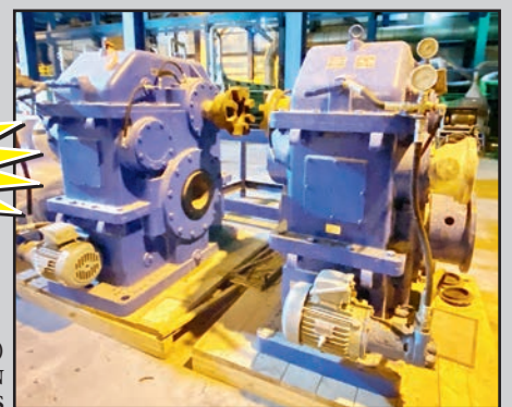
(SAMPLE) NEW HAMILTON GEAR BOXES

TERMS OF SALE: To be sold in accordance with CRG Terms of Sale as published on our websites and in the auction catalog. A buyer's premium will apply. All equipment subject to pre-auction sales. All Covid-19 safety protocols will be implemented.