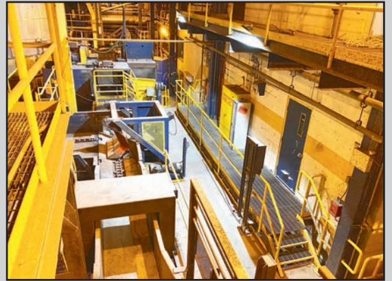
(1 OF 2) NICHOLSON DEBARKING-CHIPPING LINE OVERVIEWS