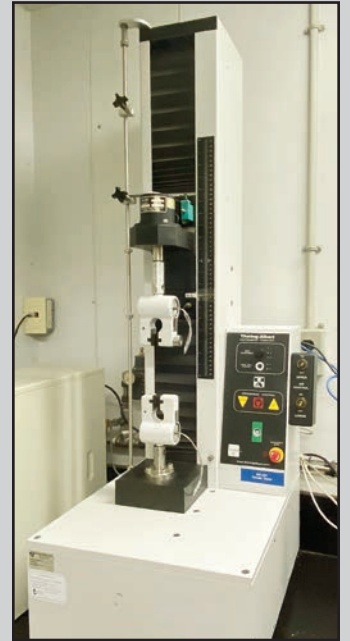
THWING ALBERT TENSILE STRENGTH TESTER