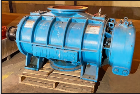
HOLMES REBUILT REPLACEMENT BLOWER