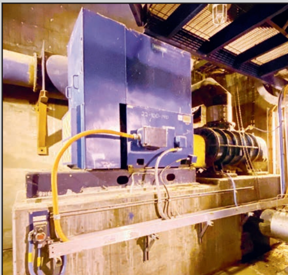
(1 OF 2) 500 HP REVERSE AIR BLOWERS