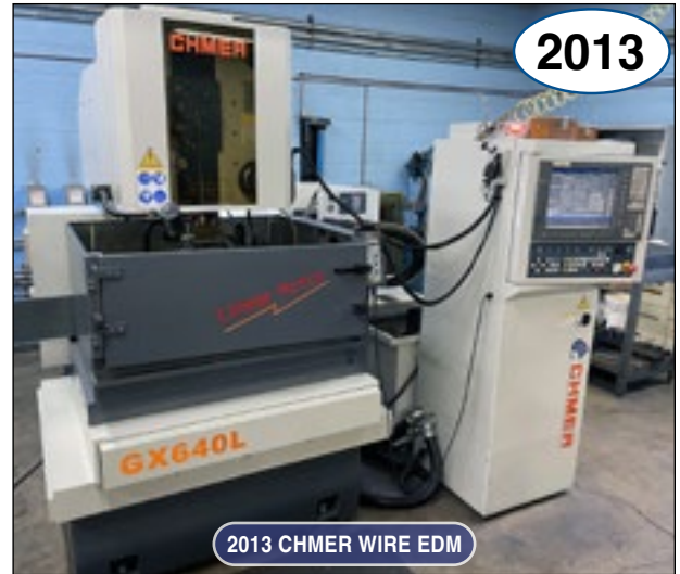
2013 CHMER WIRE EDM