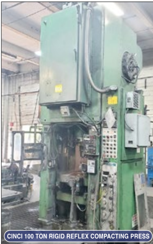
CINCI 100 TON RIGID REFLEX COMPACTING PRESS

ASSET LOCATION: 110 Gateway Road, Bensenville, IL 60106