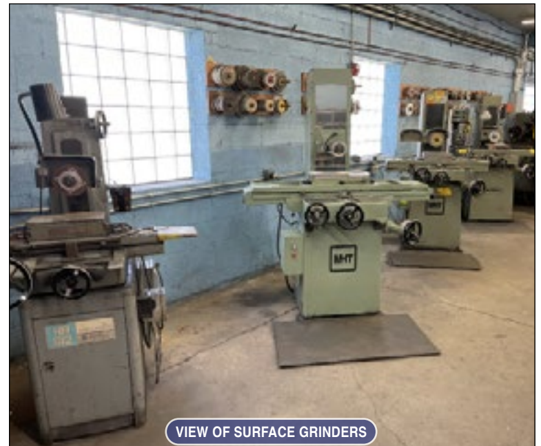
VIEW OF SURFACE GRINDERS