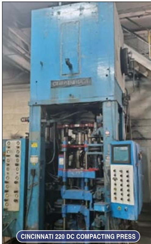
CINCINNATI 220 DC COMPACTING PRESS