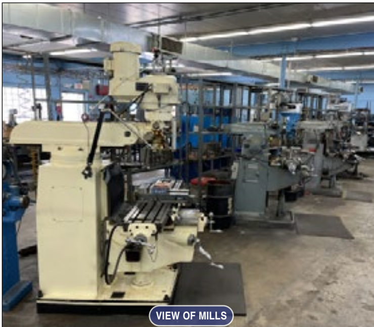
VIEW OF MILLS