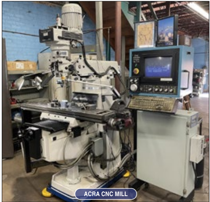
ACRA CNC MILL