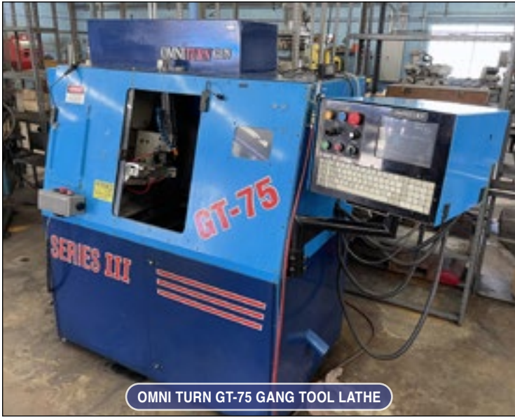
OMNI TURN GT-75 GANG TOOL LATHE