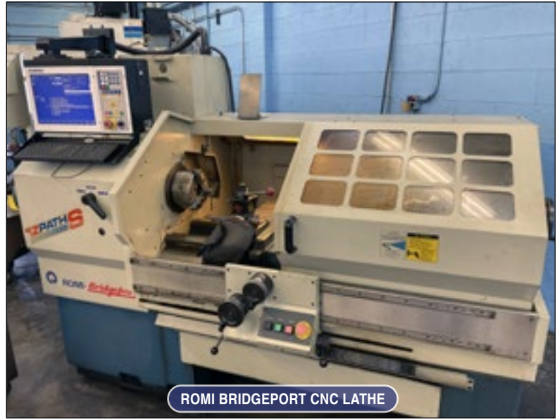
ROMI BRIDGEPORT CNC LATHE