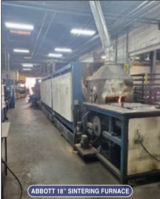
ABBOTT 18" SINTERING FURNACE