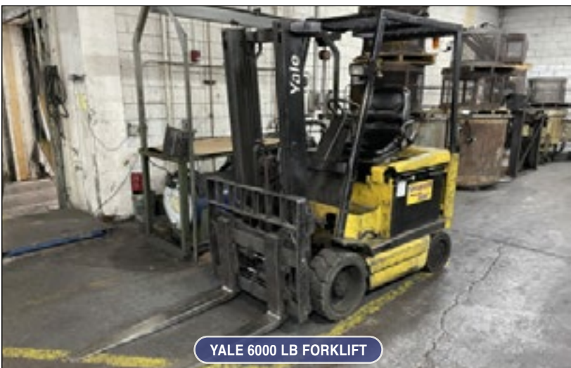
YALE 6000 LB FORKLIFT

(3) BANDSAWS, DRILL PRESSES, SANDBLAST CABINETS, PARTS WASHERS, PIPE THREADER, WELDERS, PIPE BENDERS, BRAKES, SHEARS, FORKLIFTS, COMPRESSORS, RACKING, WORK TABLES AND MORE!