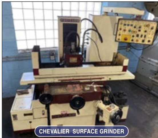
CHEVALIER SURFACE GRINDER