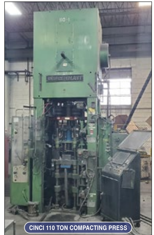
CINCI 110 TON COMPACTING PRESS

Machines, Customers, Intellectual Property all available for immediate prior sale.