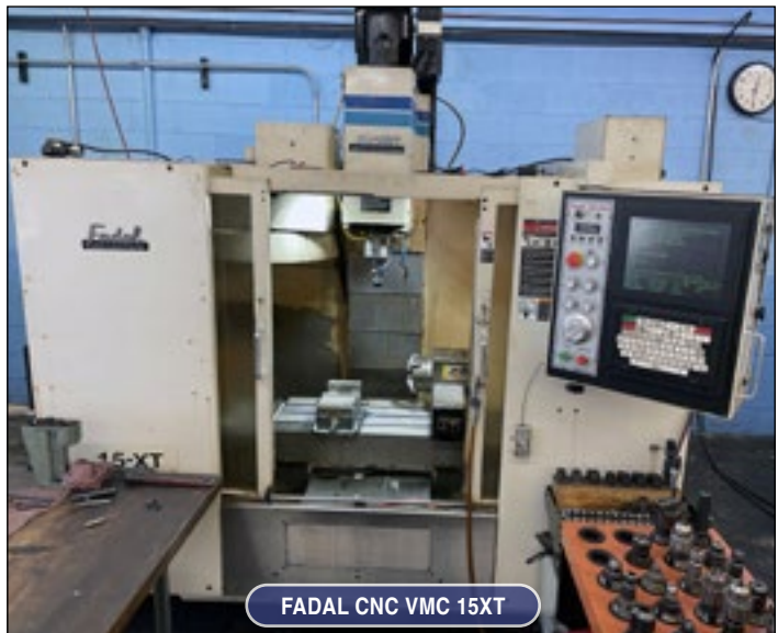
FADAL CNC VMC 15XT

BROWN & SHARPE MICROVAL CMM (4) OPTICAL COMPARATORS PRECISION INSPECTION