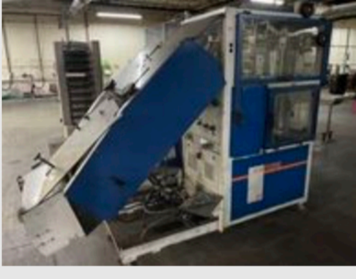
(5) Gammerler Stackers, Model STC-700