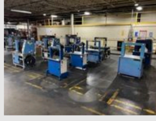
(8) Auto Strappers