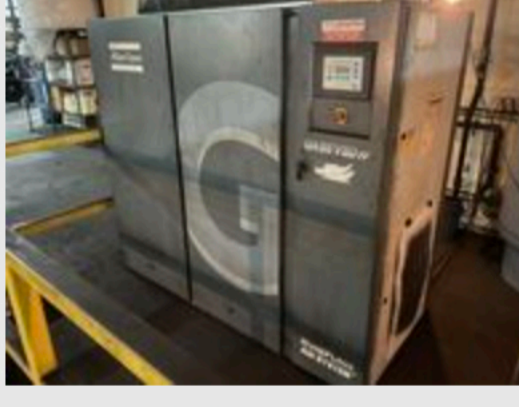
(7) Air Compressors up to 75 HP