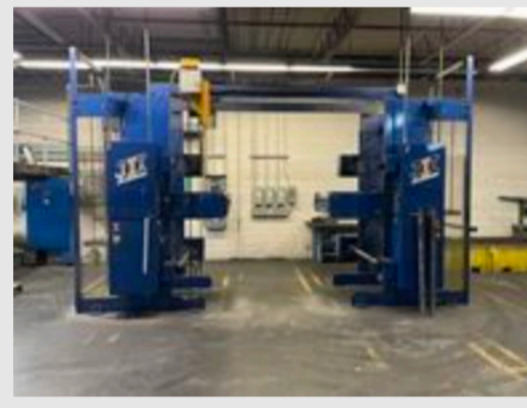
Global 35" Press, 22.75" Cutoff, 18 Units Model G145: (4) 4 high, (1) 2 high, (2) folders, (2) JTI double (1) JTI single splicers, Quadtech registration, Perretta Graphics ink control