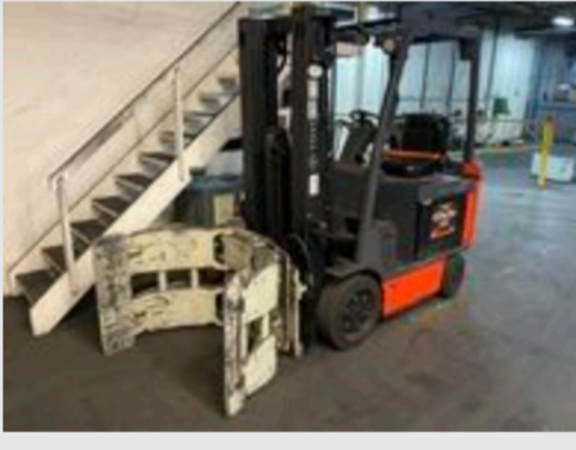
(2) Electric forklifts, 3,600 lb, w clamps