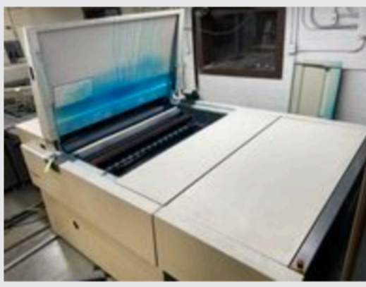
Glunz & Jensen Plate Processor