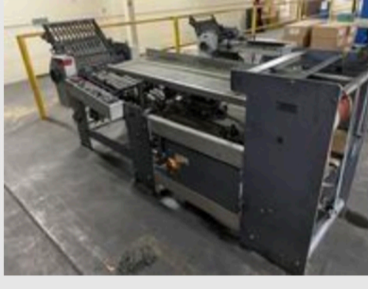
Stahl RX52A folder w 2 feeders