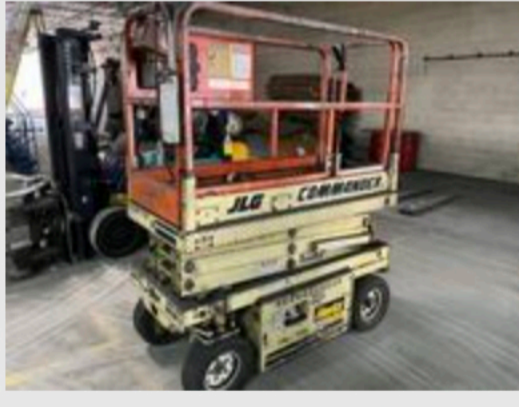
JLG Scissor Lift CM-1732