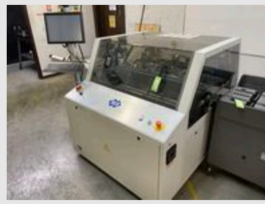
(4) Nela and Burgess Plate Benders