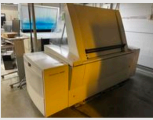
(2) Creo Trend Setter News Model TS2637