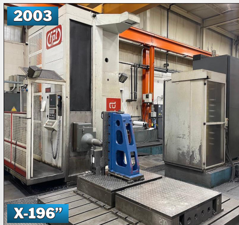
2003 X-196" FPT PRAGMA-M RAM TYPE TRAVELING COLUMN CNC HORIZONTAL BORING MILL