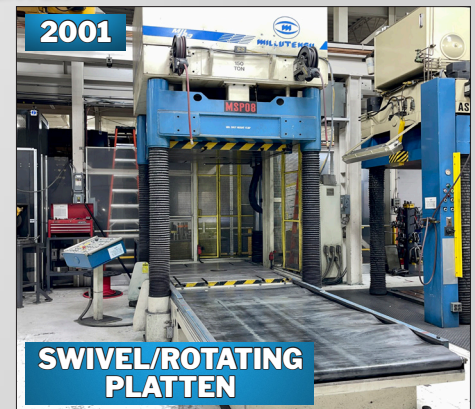
2001 SWIVEL/ROTATING PLATTEN MILLUTENSIL MIL-163 150-TON SPOTTING PRESS

INSPECTION: By Appointment ASSETS LOCATION: Windsor, Ontario, Canada (30 MIN. FROM DETRIOT METRO AIRPORT)