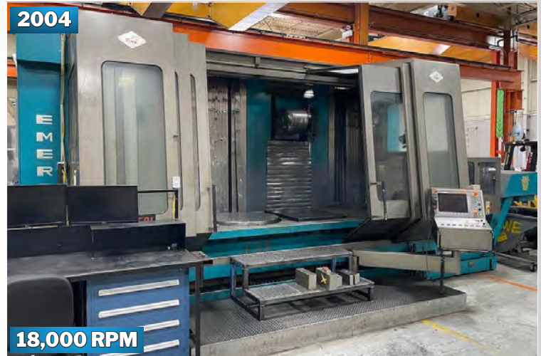
MAKINO MCC-3016VG 3+2 CNC HORIZONTAL/VERTICAL DIE MOLD MACHINING CENTER