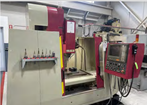
JOHNFORD JET-40 CNC VERTICAL MACHINING CENTER

PARPAS BF-160C CNC BED TYPE MILLING MACHINE , Heidenhain iTNC 530 Control, Travels X-136.7", Y-62.4", Z-58", Table Size 288" x 59", 2000 RPM Max. Spindle Speed, 80 HP, Chip Conveyor, S/N D-BF160C/1 [LOCATION: 2155 NORTH TALBOT ROAD]