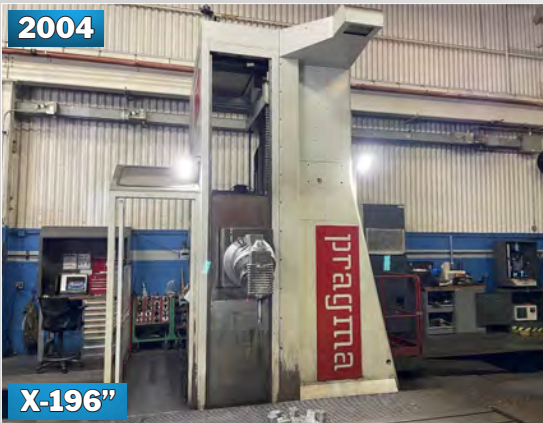
FPT SIRIO-M RAM TYPE TRAVELING COLUMN CNC HORIZONTAL BORING MILL