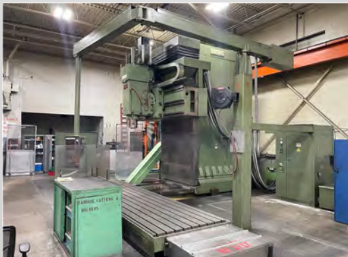
PARPAS BF-160C CNC BED TYPE MILLING MACHINE