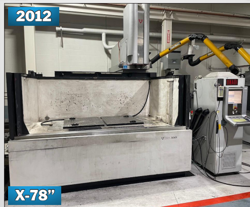
2012 X-78" ONA NX8BIL SINKER-TYPE CNC EDM