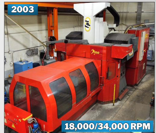
2003 18,000/34,000 RPM FPT DINO 5-AXIS HIGH SPEED CNC DOUBLE COLUMN VERTICAL MACHINING CENTER