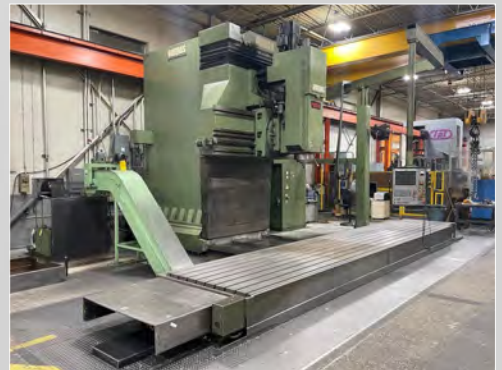
PARPAS BF-160C CNC BED TYPE MILLING MACHINE