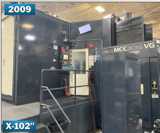
2009 X-102" MAKINO MCC-3016VG 3+2 CNC HORIZONTAL/VERTICAL DIE MOLD MACHINING CENTER

FEATURING MULTI-AXIS HIGH SPEED CNC BRIDGE MILLS, CNC HORIZONTAL BORING MILLS, MACHINING CENTERS, EDMS, AND MORE: [2009] MAKINO MCC-3016VG 3+2 DIE MOLD HMC, [2015] MAZAK VCN-700D VMC, [2010] AWEA BL-4024S TABLE TYPE HBM, (4) FPT CNC TRAVELING COLUMN HBM'S, [2017] & [2012] ONA EDM'S, [2001] MILLUTENSIL 150-TON SPOTTING PRESS, [2012] AWEA, JOHNFORDE, & FPT HIGH SPEED BRIDGE MILLS, (2) FIDIA HIGH SPEED VMC'S, TARUS CNC GUN DRILL, ANGLE PLATES, TOOLING AND MUCH MORE!