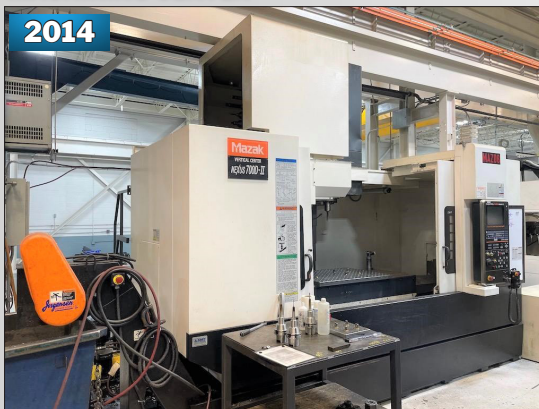
2014 MAZAK NEXUS 700D/50-II CNC VERTICAL MACHINING CENTER