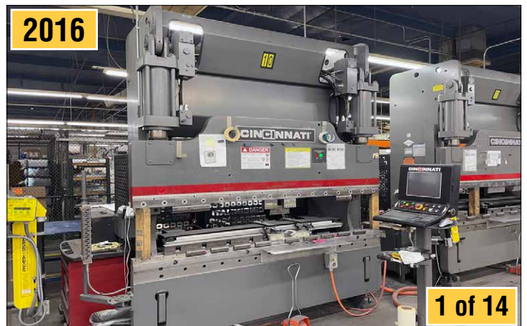
CINCINNATI 8 ft x 90-Ton Press Brake

BIDDING CLOSES: Wednesday, February 21, 2024 at 10:00am PT