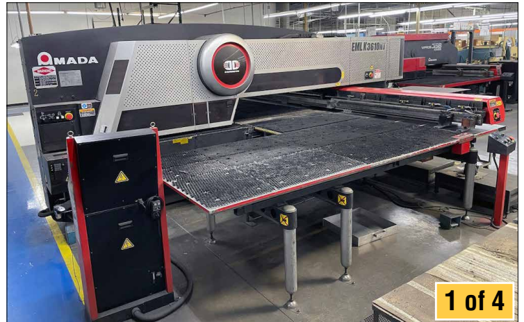
AMADA 4,000 Watt Laser & 30-Ton Turret, Model EMLK 3610NT