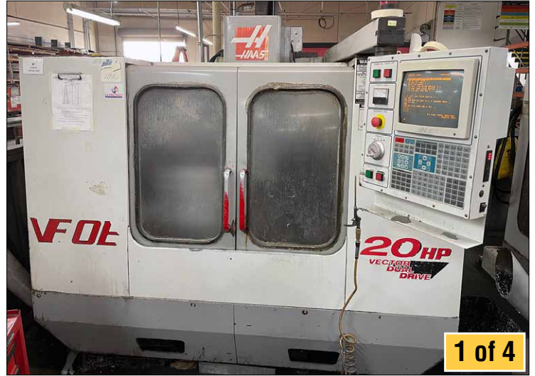
HAAS CNC VMC, Model VFOE