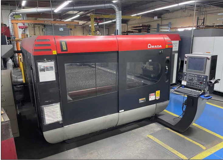
AMADA 4,000 Watt Laser, Model LC 3015 F1NT