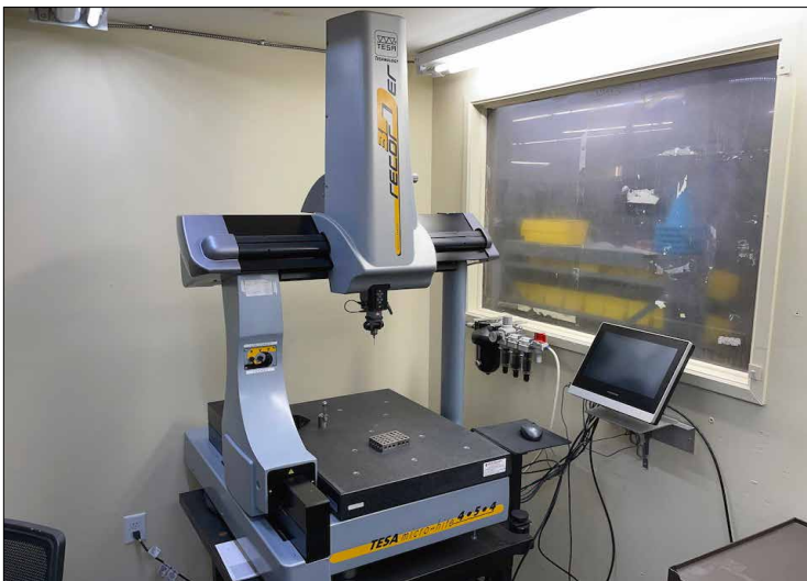
TESA Micro Hite 4-5-4 CMM