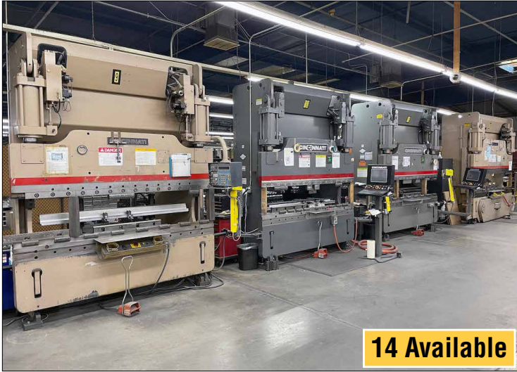
CINCINNATI Press Brakes, 90 to 135-Ton