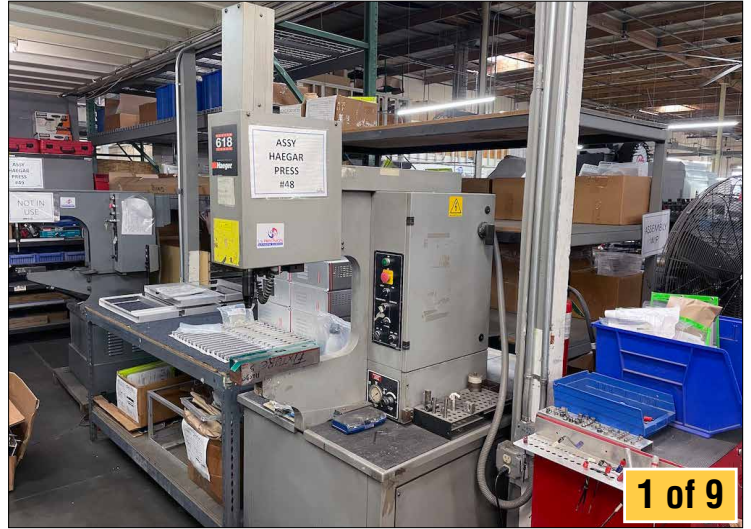
HAEGER Insertion Press, Model 618H