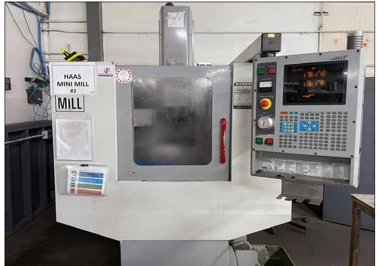
HAAS Mini Mill