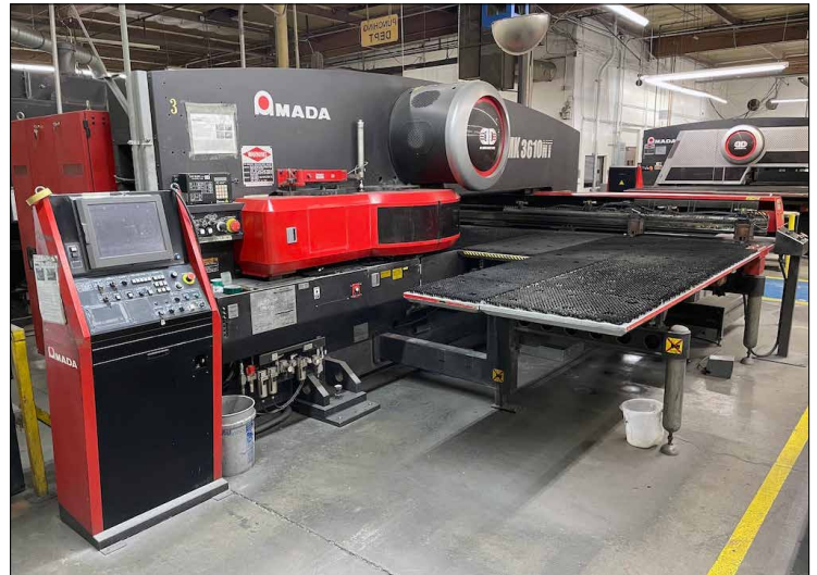
AMADA 30-Ton Turret Punch, Model EMK 3610NT