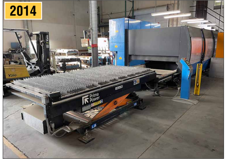
PRIMA POWER 5000 Watt Laser, Model CV5000