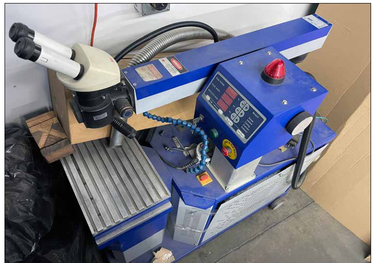
OR LASER TECHNOLOGY Microwelder, Model LRS 120