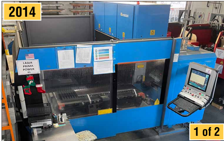
PRIMA POWER 5000 Watt Laser, Model CV5000

Quality Fabrication & Surplus to US Precision Manufacturing CNC Machining, Turret Punches, Laser Cutting, Stamping, Furnaces & Finishing