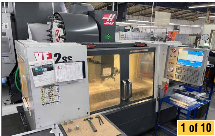
HAAS CNC VMC, Model Super VF2SS