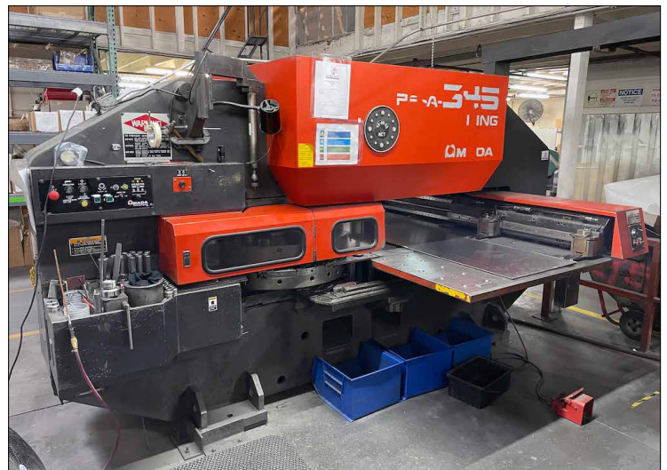
AMADA PEGA 345 King, 30-Ton Turret