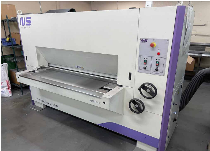
NS MAQUINAS Belt Sander, Model DM1600C