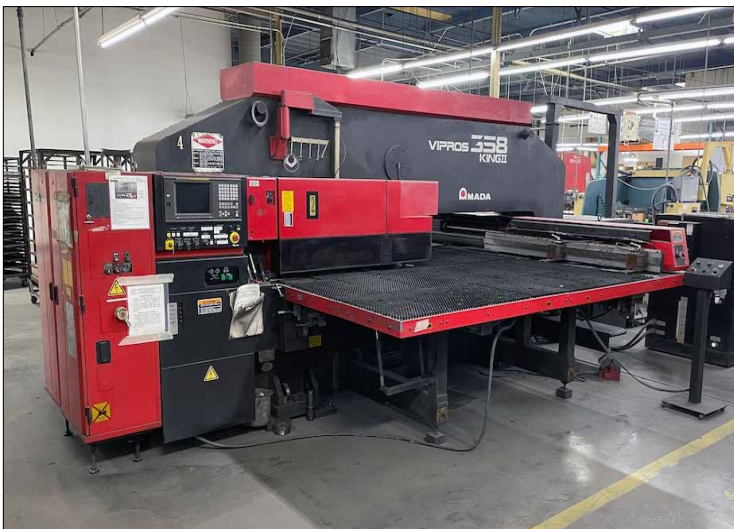
AMADA VIPOSS 358 KING II, 30-Ton Turret