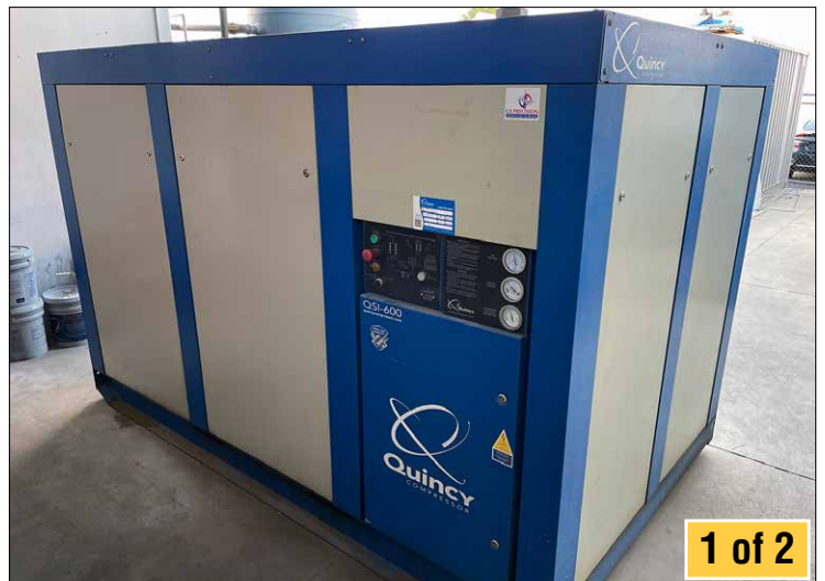
QUINCY Compressor, Model QSI-600