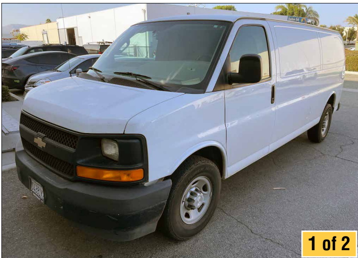
CHEVROLET Express Cargo Van