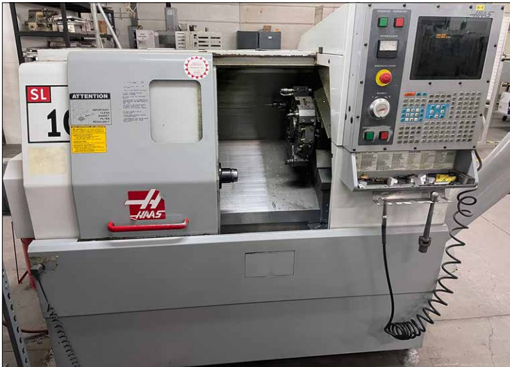
HAAS SL10 CNC Lathe