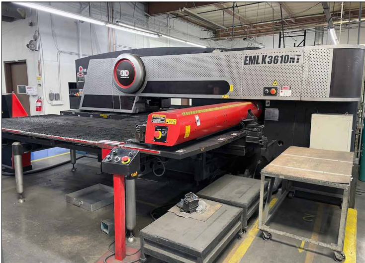
AMADA 4,000 Watt Laser & 30-Ton Turret, Model EMLK 3610NT