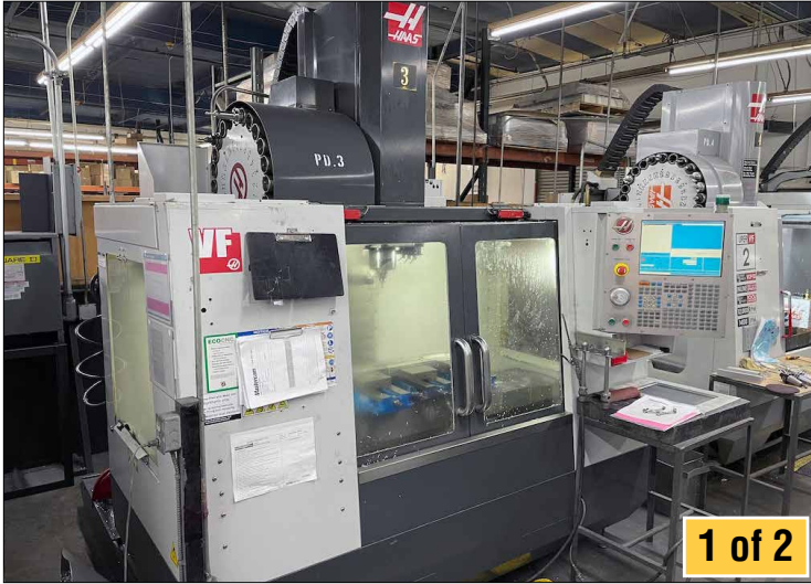
HAAS CNC VMC, Model VF-2SS