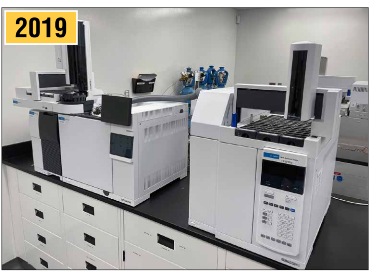
AGILENT Headspace Sampler, GC, Autosampler