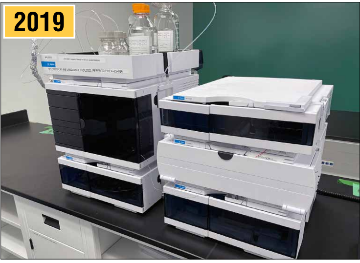
AGILENT 1260 Infinity II Multi Sampler, Liquid Chromatograph