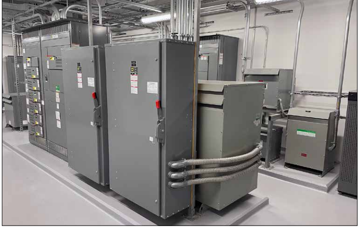
View of MCC