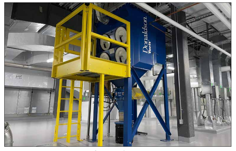
TORIT Dust Collector