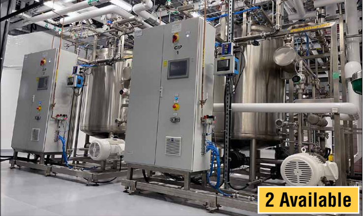
TEKNEMA (CIP) Clean In Place Systems

BIDDING CLOSES: Thursday, February 22 at 10:00am ET INSPECTION: Wednesday, February 21, 9:00am to 5:00pm ET LOCATION: 7300 Trans-Canada Hwy, Pointe-Claire, QC H9R1C7