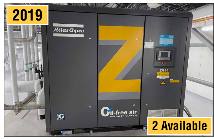
ATLAS COPCO 120 HP Compressors