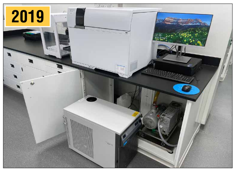
AGILENT ICP-MS, Autosampler, Chiller