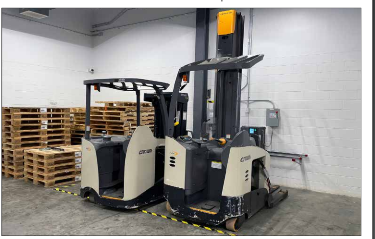
CROWN Reach Trucks