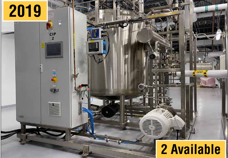
TEKNEMA Clean in Place