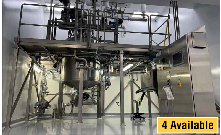
Gel Formulation & Fill Systems