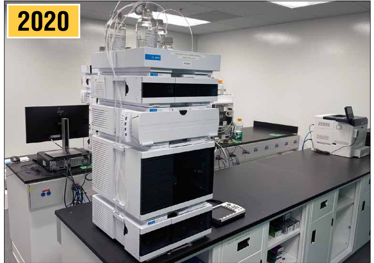
AGILENT 1260 Infinity II Multi Sampler, Liquid Chromatograph