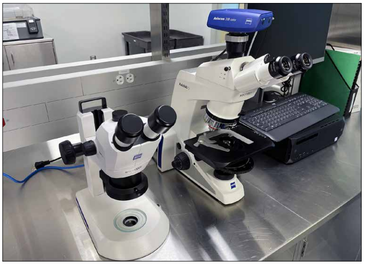
ZEISS Digital Microscopes