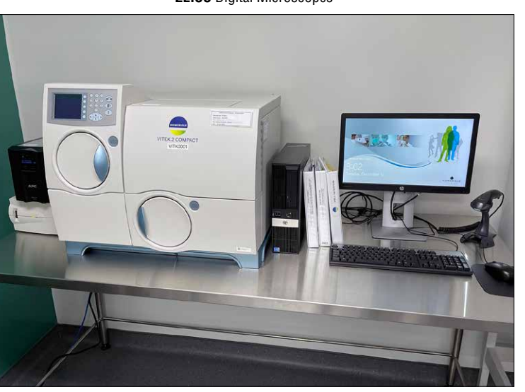
BIOMERIEUX Vitek 2 Compact Auto ID/AST Instrument