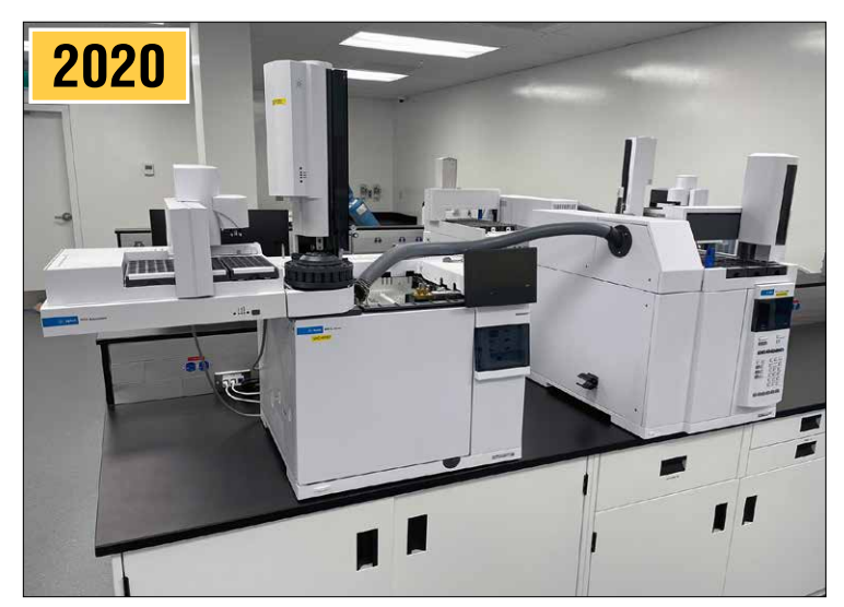
AGILENT Headspace Sampler, GC, Autosampler