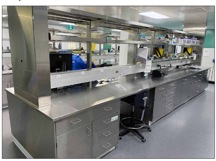
Partial View of Stainless Steel Lab Stations