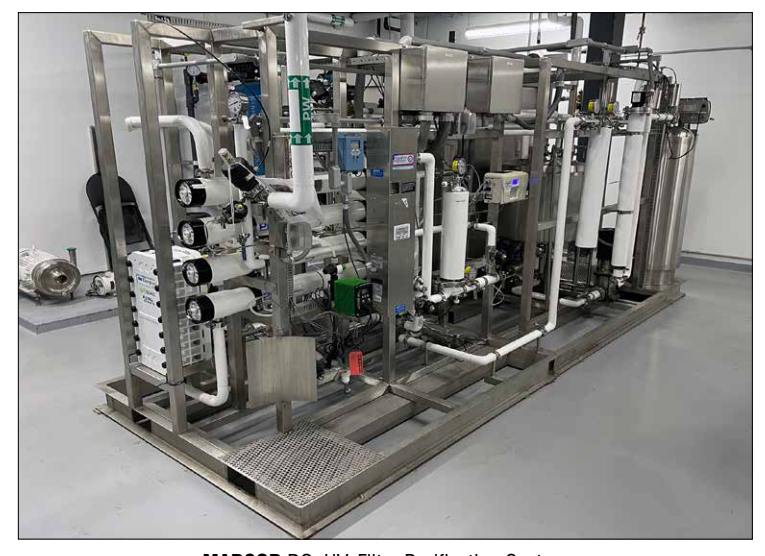
MARCOR RO, UV, Filter Purification System