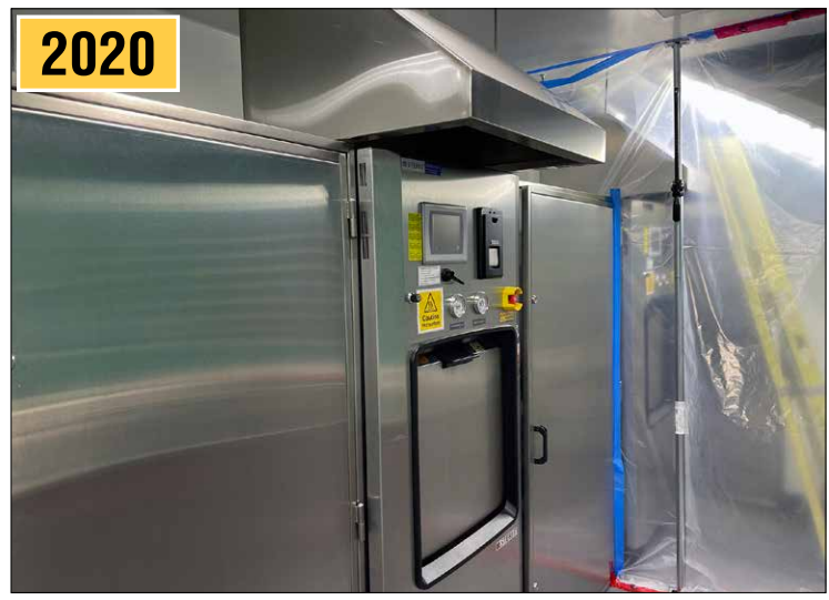
STERIS Steam Sterilizer