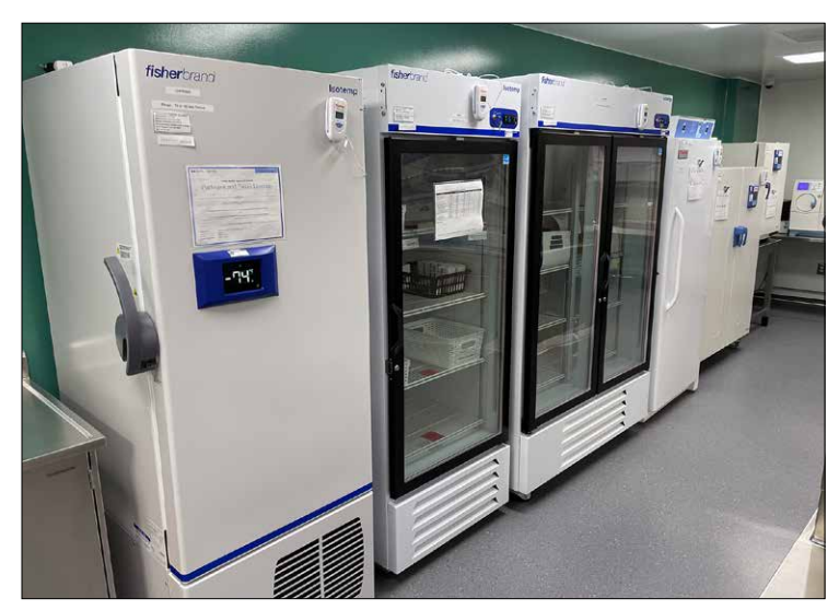
View of THERMO SCIENTIFIC, FISHERBRAND Freezers, Refrigerators, Incubators