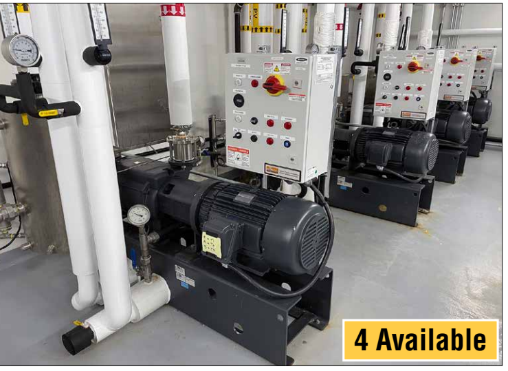
BUSCH Dolphin 20 HP Vacuum Pumps