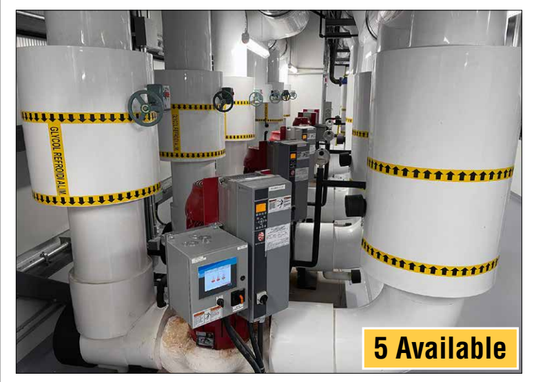
30 HP Glycol Pumps