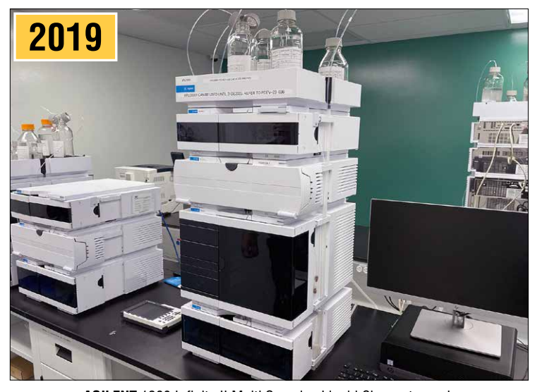
AGILENT 1260 Infinity II Multi Sampler, Liquid Chromatograph